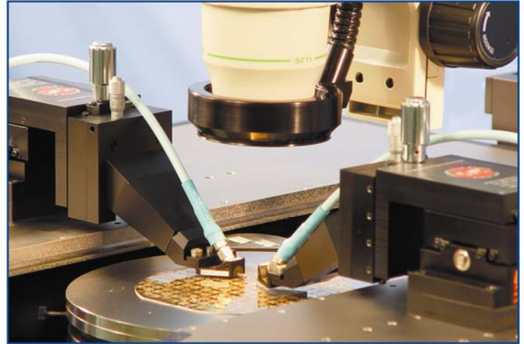
The WL-210 calibration chuck offers 3 substrate sites which support either landscape or portrait format calibration substrates.

Take another look at SIGNATONE – Perhaps for the first time. We listened, and we think you'll like what you see.