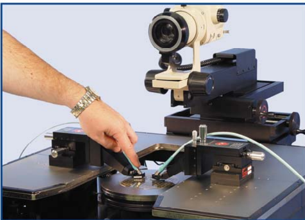
The tilt-back microscope provides unobstructed fixturing access.