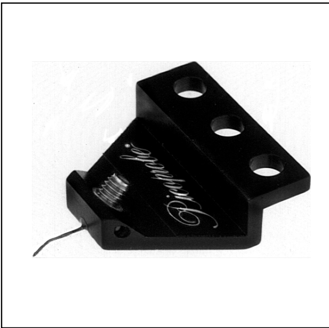
Model 110H Picoprobe® with female 1.0 mm connector