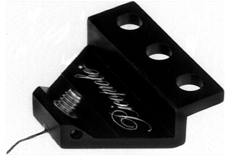
Model 110H Picoprobe®