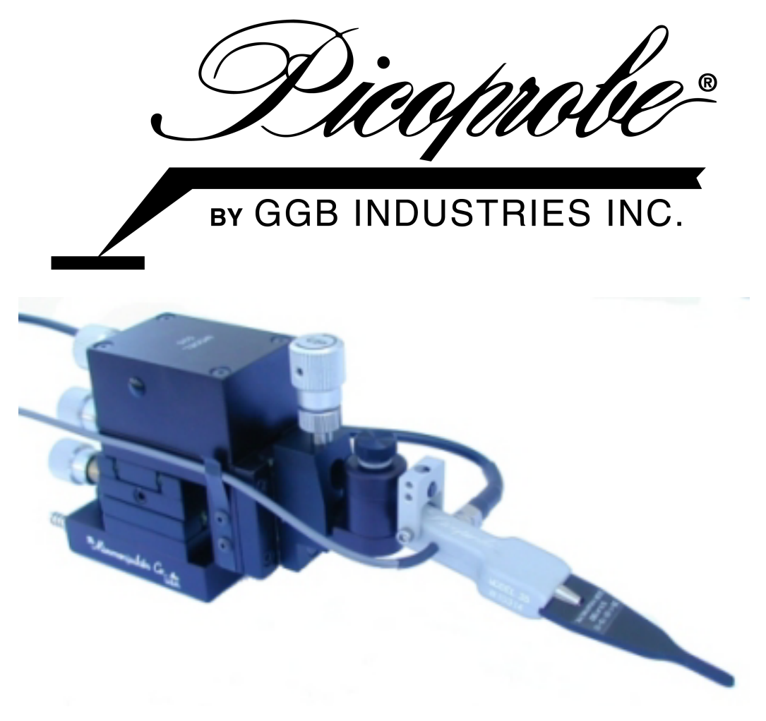
(Shapes available for use on any micropositioner with any probing system.)

The Picoprobe<sup>®</sup> Model 35 has been engineered to meet the stringent demands of advanced high frequency circuit designers. This probe combines full DC capability, rise/fall times of 14 ps, and a nominal loading input impedance of 1.25 megohms shunted by 0.05 pf. Signal attenuation is 10:1 with a 50 ohm oscilloscope input. Like our other active probes, the Model 35 achieves its bandwidth using just one probe point, which greatly simplifies internal node testing without sacrificing performance. An assortment of user replaceable probe tips are available for a variety of probing needs. The Model 35 is powered by our new PS-3 power supply.